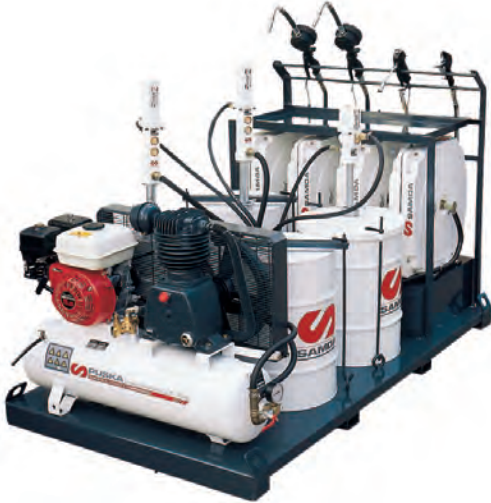
A wide variety of lube skids are available.