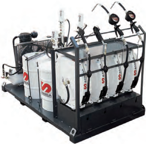
Depending on your application, lube trailers can be a flexible solution.

Mobile lube trucks, trailers, and platforms are utilized in situations where it is necessary to bring the lubricants to the piece of equipment or machine. For example, the construction industry has many pieces of equipment such as dozers, scrapers, haul trucks, and other equipment where it is more practical and economical to service in the field. Industrial applications such as in-plant use are also another application where moving the lube equipment to the machine is the proper solution.