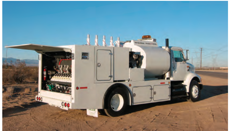
Lube trucks of all shapes, sizes and capabilities.

Contact us today to find out how we can make this solution work for you!