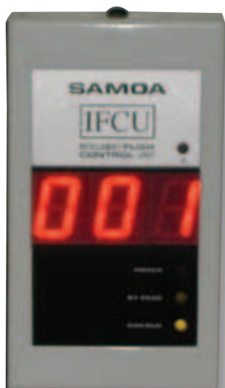
Dispense point control from 5 GPM for car and light truck shops all the way to 30 GPM for heavy duty applications

The IFCU is a dispense point controller located at each dispense point and includes the solenoid, pulser, filter, and display of product dispensed for that point. The filter is readily accessible for cleaning. The three digit large character super bright LED display shows the dispense point number when not in use and displays the quantity dispensed during use. Three LED indicator lights show the status of the dispense point.